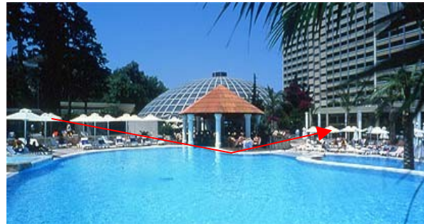
Sound propagation over reflecting surfaces.

Standard double for single €80 Standard double room €100